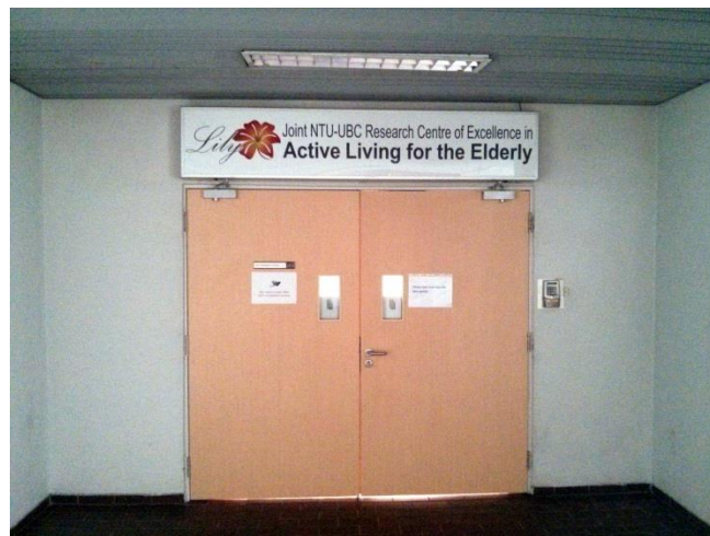
The entrance of the LILY Research Centre