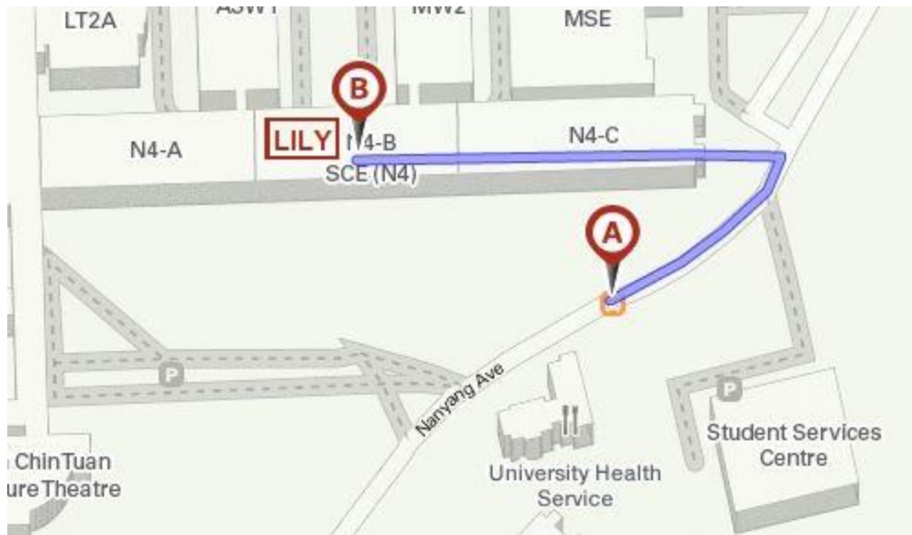
Walking to LILY from the NTU Campus Rider bus stop