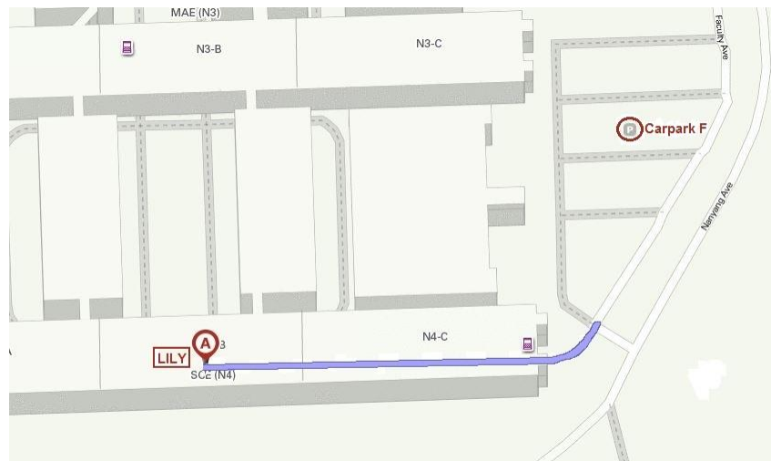
Walking to LILY from carpark F