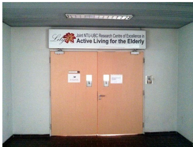
The entrance of the LILY Research Centre