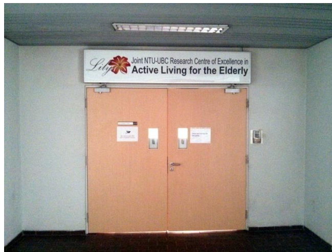
The entrance of the LILY Research Centre