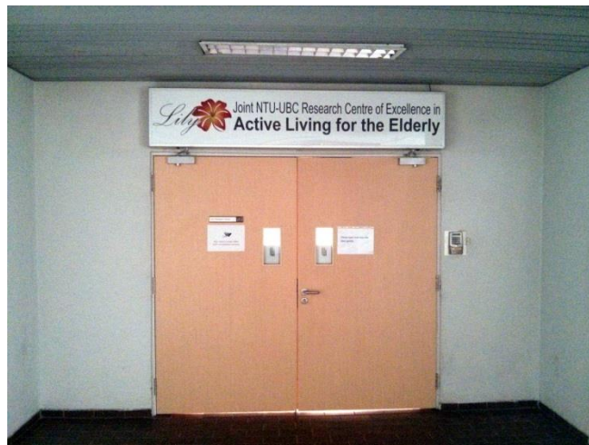
The entrance of the LILY Research Centre