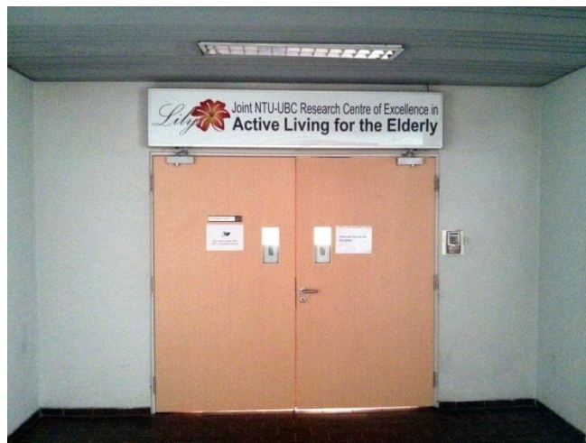
The entrance of the LILY Research Centre