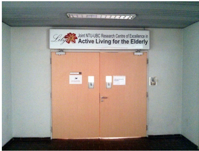
The entrance of the LILY Research Centre