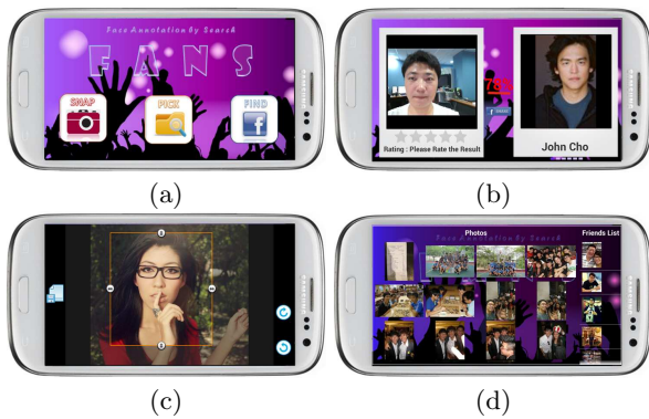
Figure 3: (a) Interface of the mobile application, (b) Annotation result using a captured photo, (c) Edit and crop image, and (d) Access the photo albums on the Facebook.

trieval database. The middle number indicates the similarity value between the query image and the most similar facial image. By clicking the Facebook button below the similar number, users can share the annotation results with their friends via social networks. FANS also allows users to rate the annotation results in FANS App. In particular, under the query image, a bar of five star is given to let users vote the annotation result. For a large size image, users can crop out the facial image region with FANS App as the query image, as shown in Figure 3 (c). By clicking the second button or the third button, users can respectively access the album images in the mobile device or in their Facebook account, so as to explore facial images as queries to interact with FANS, as shown in Figure 3 (d).