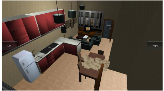
Fig. 2. A camera view of the virtual home in the Virtual Escape Exergame.

Kaplan and Kaplan [8] indicated that familiarity could promote the cognitive processes of the elderly and increase their confidence in interacting with new technologies. The elderly will perform better and guide their own behaviors when they face familiar objects and environments. Hence, by applying the aforementioned three aspects of familiarity design in exergames, the elderly may not need to learn new technological language or adapt to unfamiliar environments. Alternatively, they can utilize their prior experiences, which are learned from non-technical areas, to complete the basic exercise tasks embedded in the exergames. Another advantage of our proposed approach is that the elderly can take less cognitive effort to accomplish the exercise requirements, which is more practicable for the elderly with cognitive difficulties. With all these advantages, we aim to follow this approach to