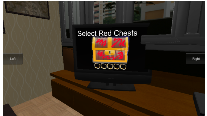
Fig. 3. An example of task design in Virtual Escape Exergame.

In order to incorporate the actionable familiarity into the manipulation design, the tasks we designed in VEE mainly come from the elderly's daily life scenarios, which can encourage the elderly to transfer their daily life knowledge into the virtual environment. For example, when the elder player has to find the information from the television in the game (see Fig. 3), they just need to follow the steps of watching television in their home: Open the television and then change channels to find the correct chest. The difference lies in that they may not have a remote controller. All they need is to use their arms to complete the tasks in front of the Kinect cameras, which is beneficial to their physical exercises. In order to design more familiar tasks for the elderly, we also transform some simple daily housework into the VEE tasks. Because the elderly are familiar with these housework, they should be able to quickly understand the tasks based on their